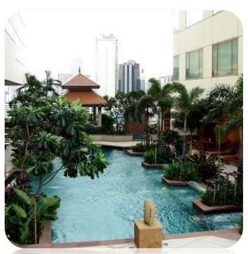
Resort Style Swimming Pool